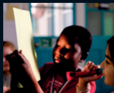
Year 3 children taking part in a Science investigation about light and the reflective property of materials.