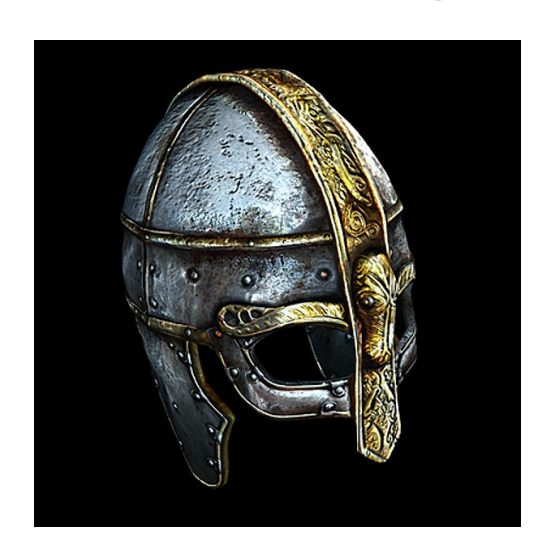
Year 4 Autumn Term. Raiders and Invaders